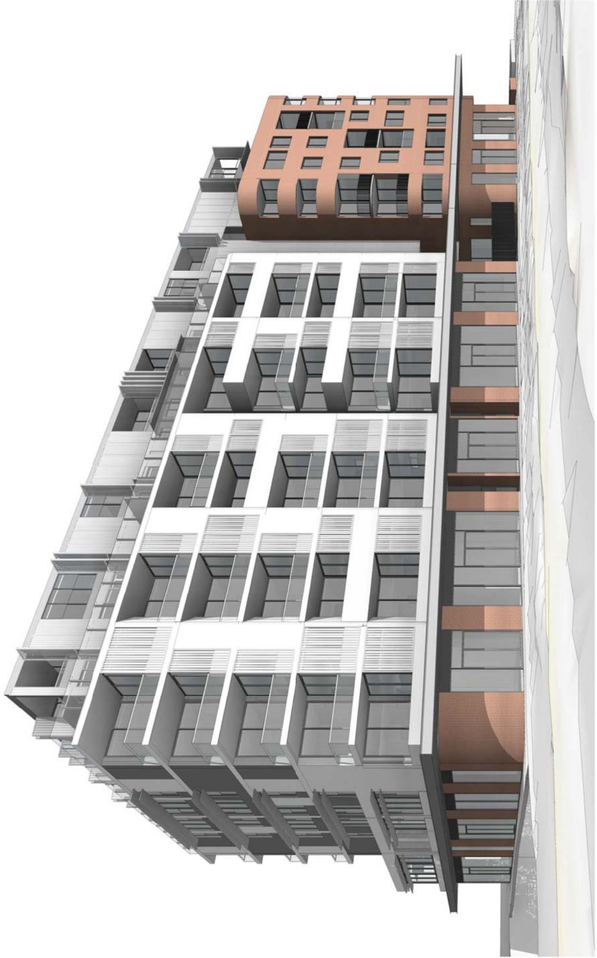
1 PERSPECTIVE VIEW 1