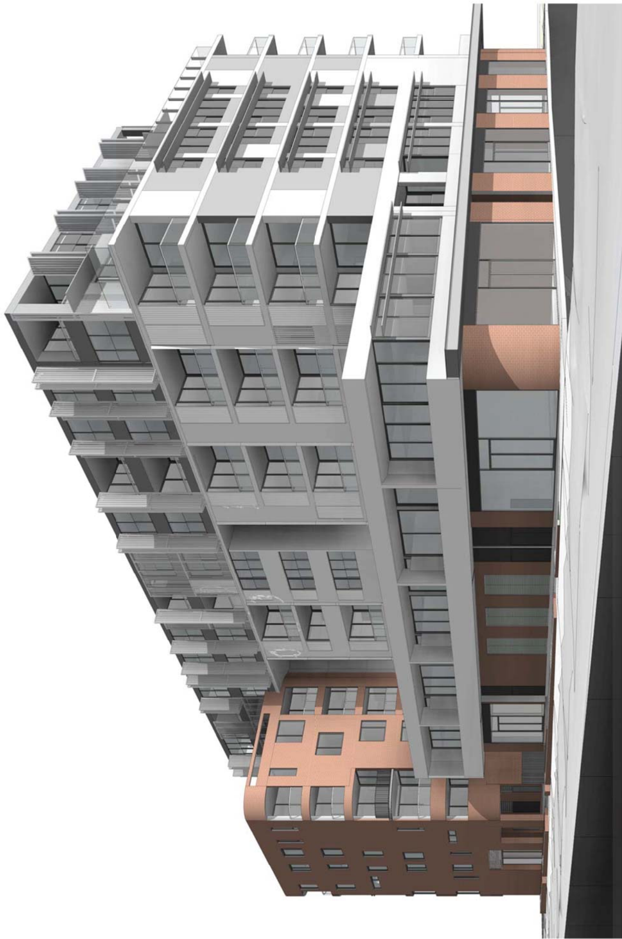
1 PERSPECTIVE VIEW 2