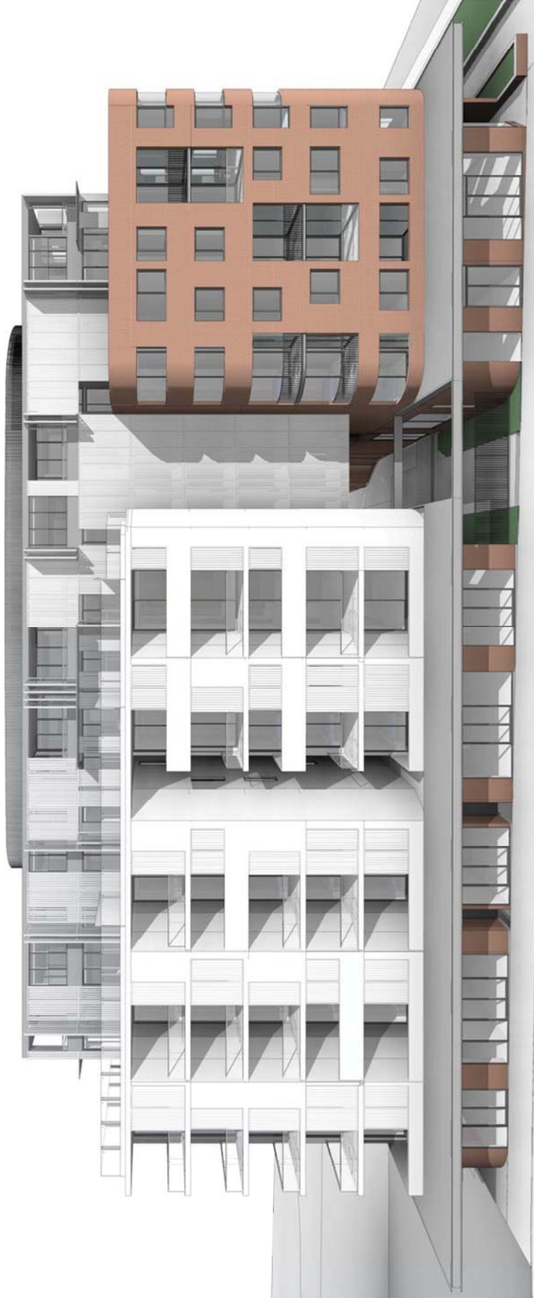
1 PERSPECTIVE VIEW 3