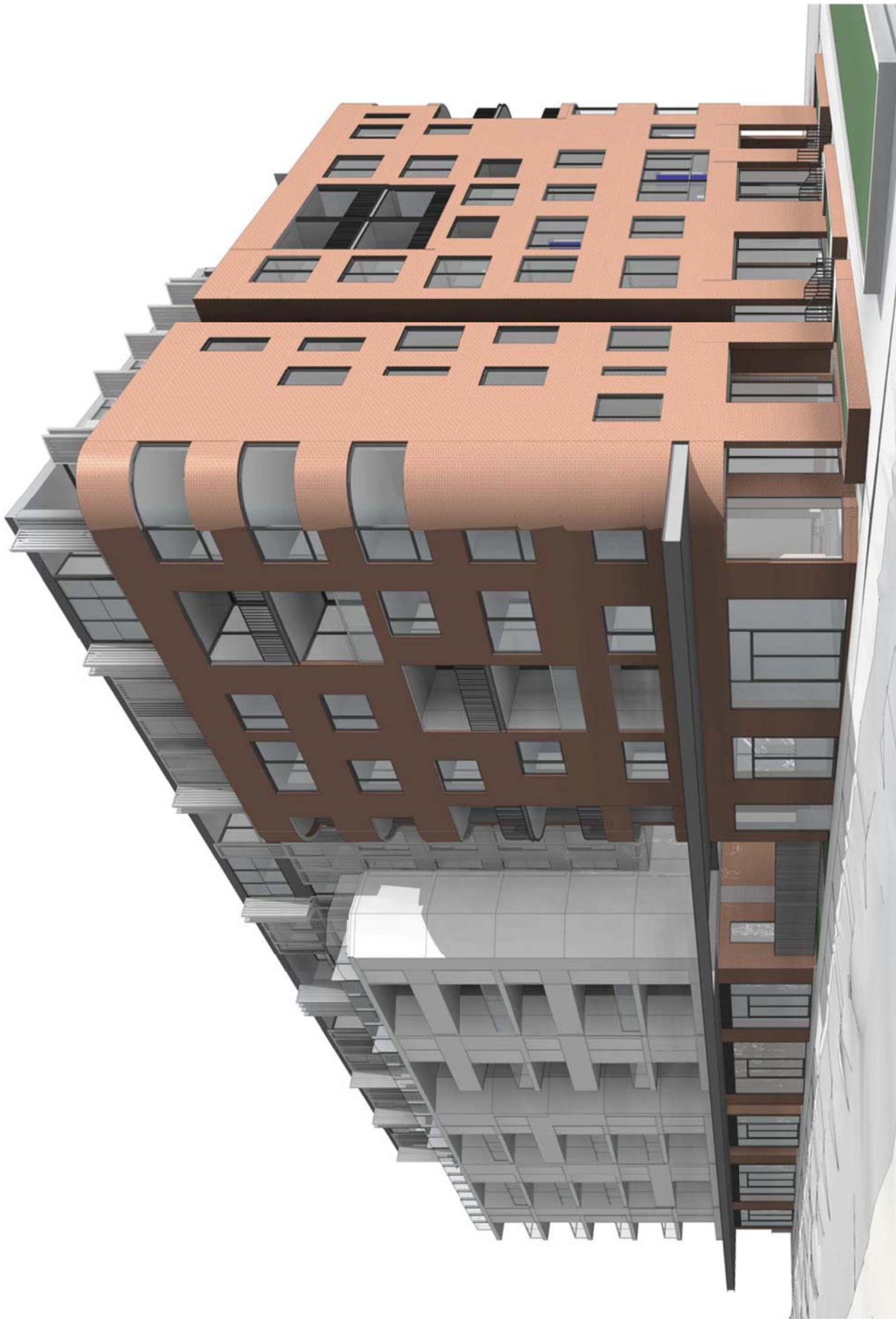
1 PERSPECTIVE VIEW 4